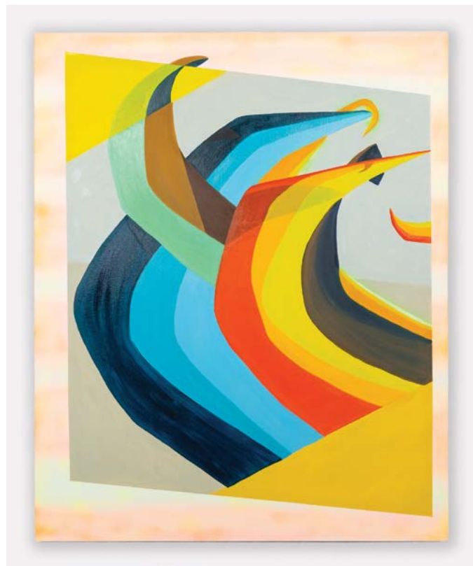
"Home for Leaves", 2018, oil, airbrush, and plaster on canvas, 20 x 16 inches, (opposite)