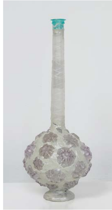
"Blue Syrian Vessel with Long Neck (small)", 2017, repurposed plastic, hot glue, resin, acrylic polymer, glass, paint 15 x 5.5 x 6 inches (left)