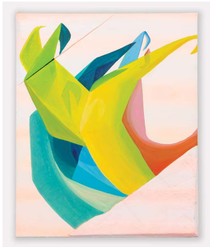
"Home for Leaves II", 2018, oil, airbrush, and plaster on canvas, 20 x 16 inches (above)