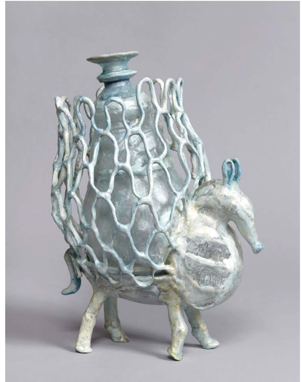
"Walking Animal with Dense Net", 2018, repurposed plastic, hot glue, acrylic polymer, metal, resin, paint, mica, 12 x 6 x 9 inches