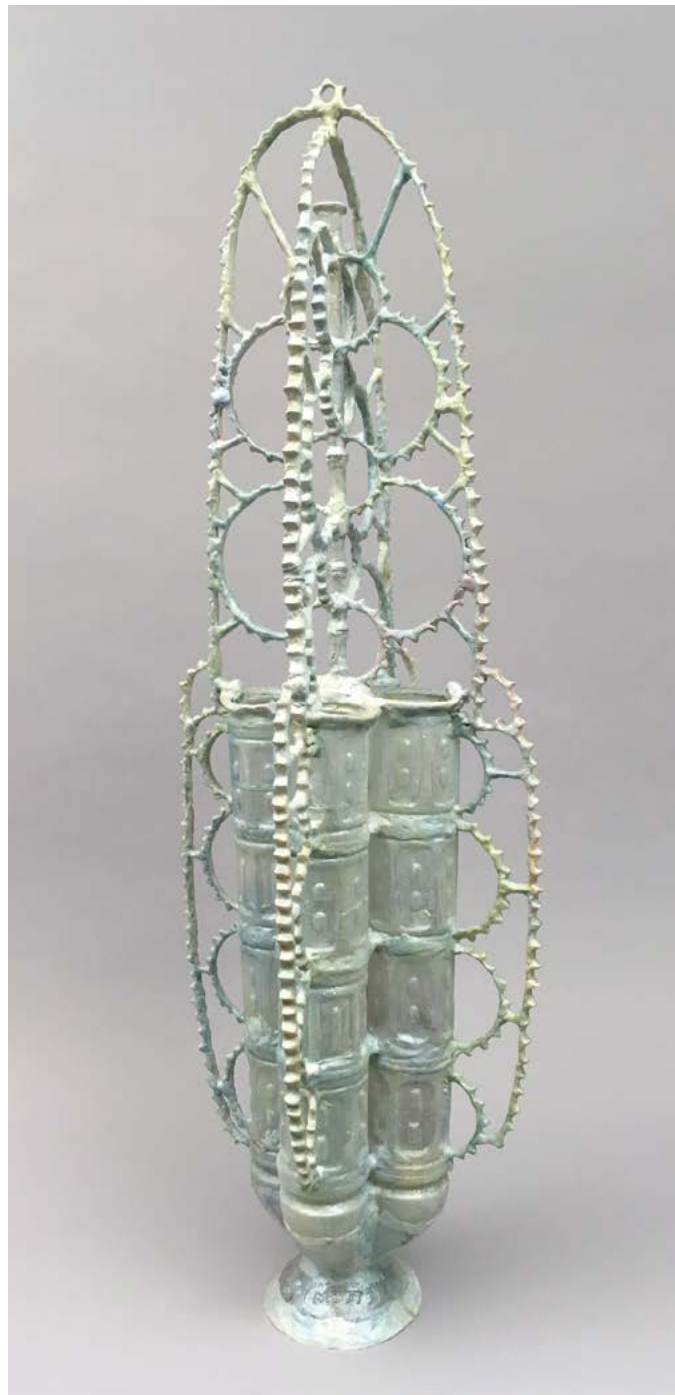
"Vessels with Spokes", 2018, repurposed plastic, hot glue, acrylic polymer, resin, metal, mica, paint, glitter, 39.5 x 12 x 12 inches (left)