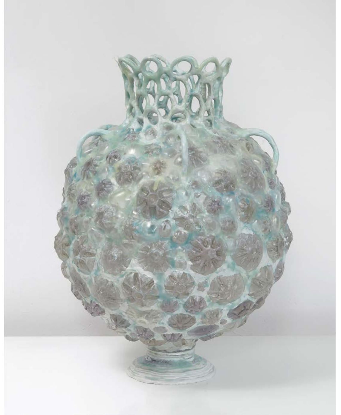
"Round Vessel with Crown", 2016, repurposed plastic, hot glue, resin, acrylic polymer, mica, paint, 25 x 18 x 18 inches (right)