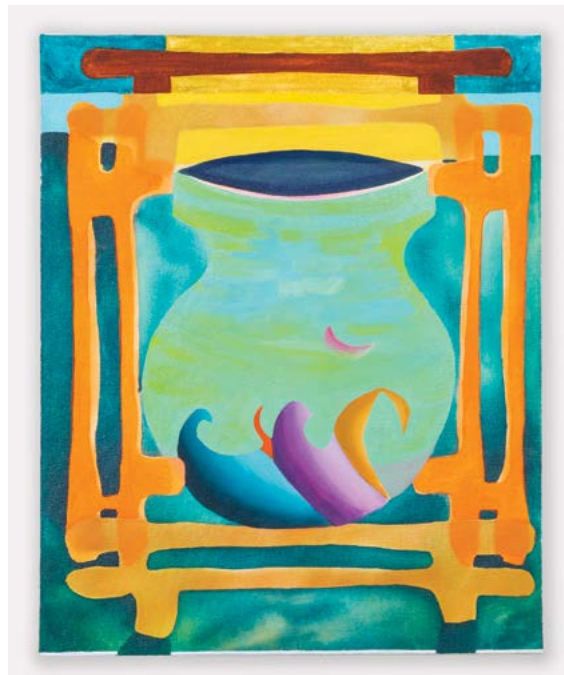
"Orchestra For Flowers", 2019, oil and airbrush on canvas, 20 x 16 inches (right)