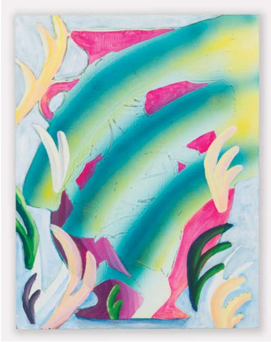
"Memory Wins", 2018, oil and airbrush on panel, 46 x 56 inches (above)