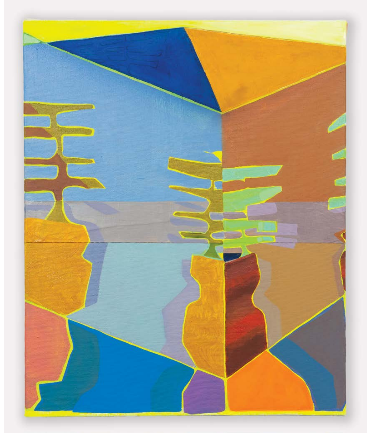
"No Shadows", 2019, oil, airbrush, and plaster on canvas, 20 x 16 inches, (opposite)