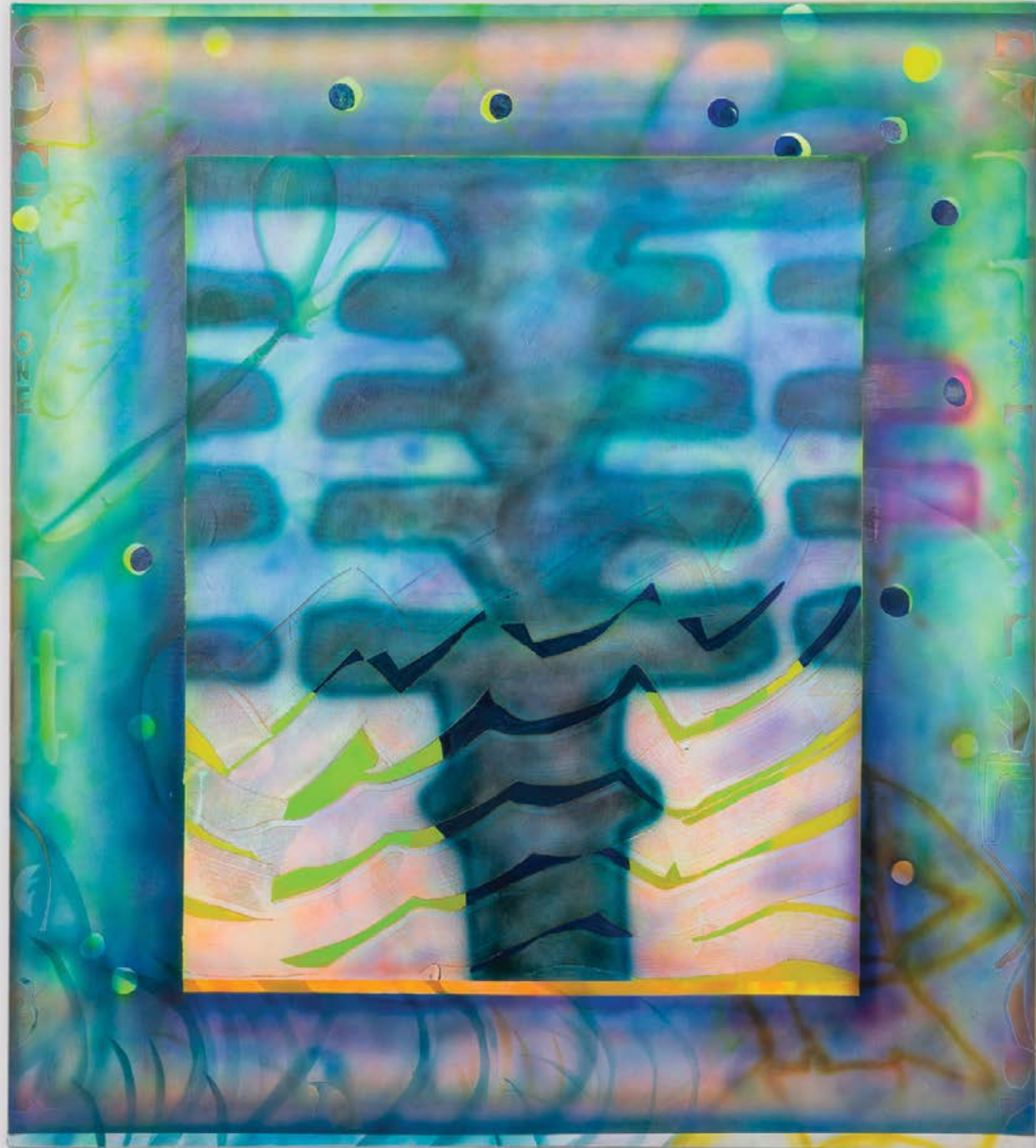
"Bleu Ridge", 2019, oil and airbrush on canvas, 48 x 56 inches