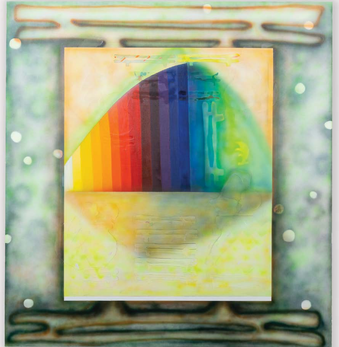
"Color Cones & Water II", 2019, oil, paper, and airbrush on canvas, 48 x 56 inches