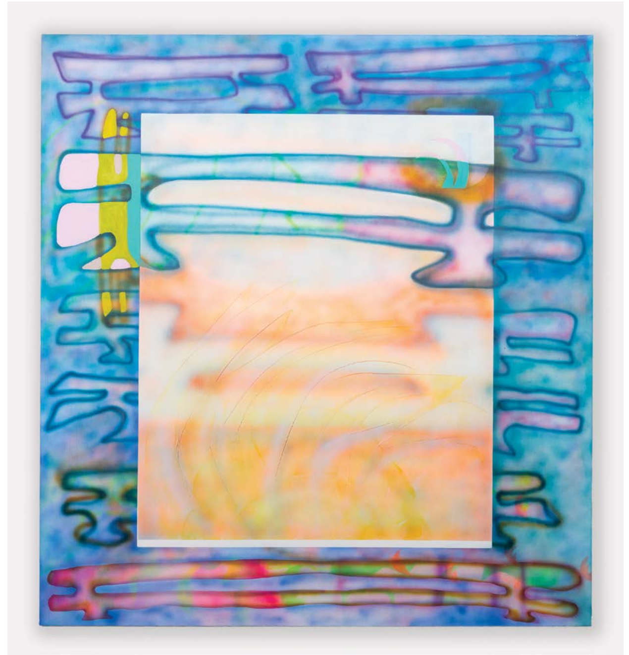
"Benched There", 2019, oil and airbrush on canvas, 46 x 56 inches