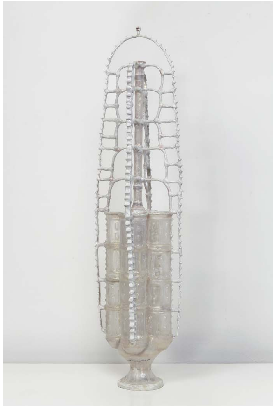
"Four Vessels with Exoskeleton (Pink and Gold)", 2017, repurposed plastic, hot glue, paint, resin, metal, 37 x 10 x 9 inches (opposite)