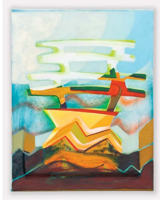
"To Float", 2019, oil, airbrush, and plaster on canvas, 20 x 16 inches, (above right)