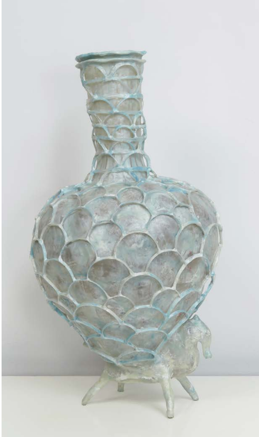
"Animal with Net", 2017, repurposed plastic, hot glue, acrylic polymer, resin, paint, mica, 28 x 15 x 15 inches (left)