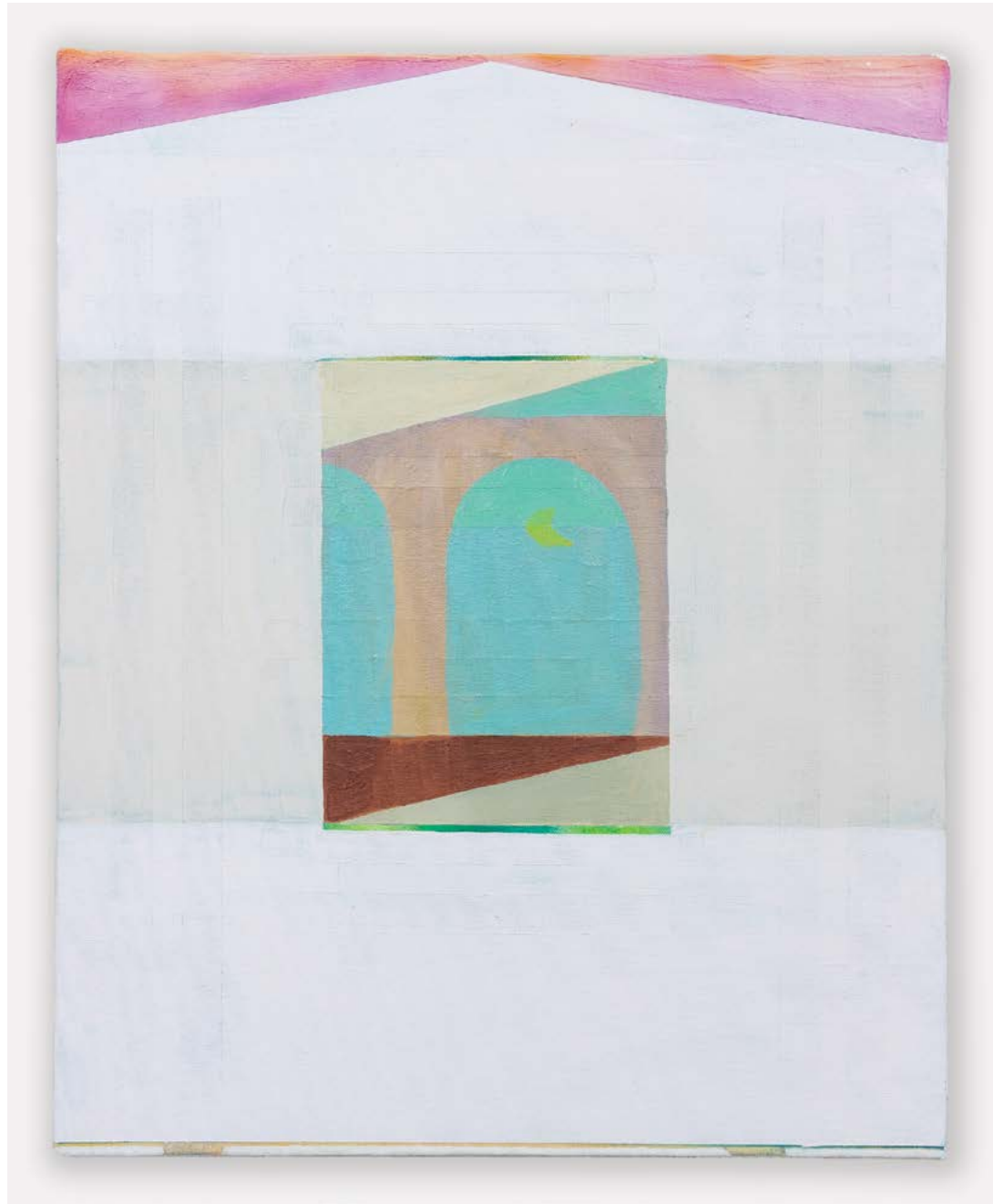
"Bernard", oil, airbrush, and plaster on canvas, 20 x 16 inches