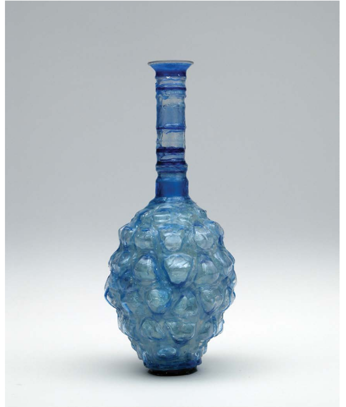
"Shiny Blue Vessel", 2014, repurposed plastic, hot glue, resin, 11 x 4 x 4 inches (opposite)